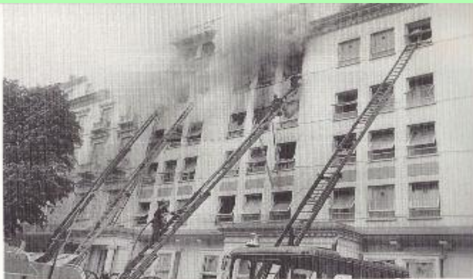
▲ The Leinster Towers Hotel fire in London's Bayswater from which 45 residents were rescued after fire broke out on the fourth floor soon after dawn. Note the wheeled escapes and hook ladders in use as over 100 firefighters finally get the upper hand. 6 June 1969