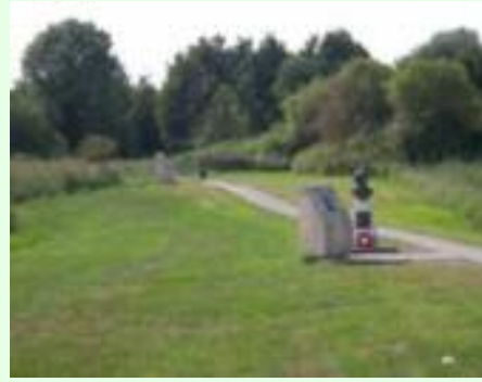
Points where Gliders landed 47Yds from the Bridge