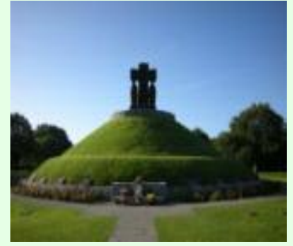
German Cemetery at La Cambe