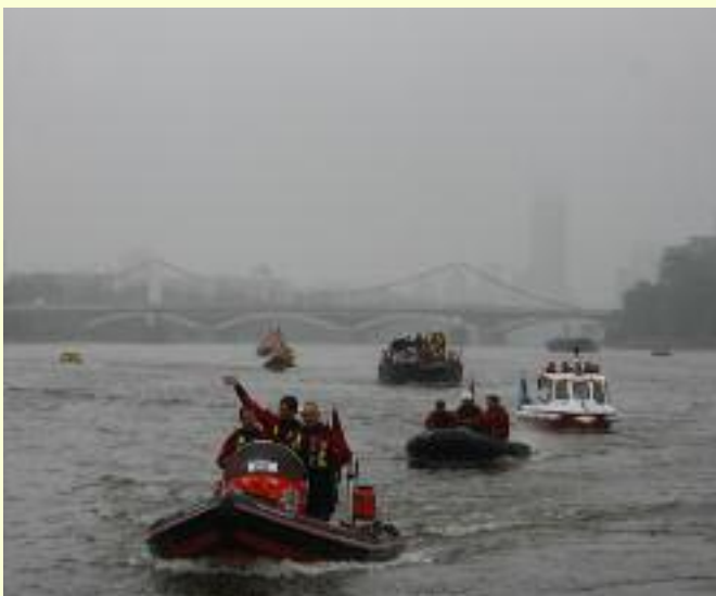
Photo taken from the Fire Flash looking back to: The Jim Steel, Merseyside Marine rescue 1, St Mungo, Pyronaut, Dave Moore, Fire Hawk