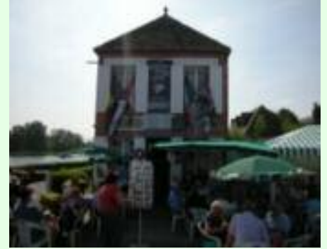
Cafe Grondee at Pegasus Bridge