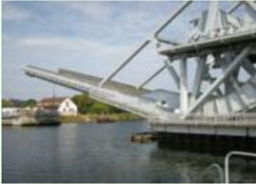
The New Bridge being raised for Shipping