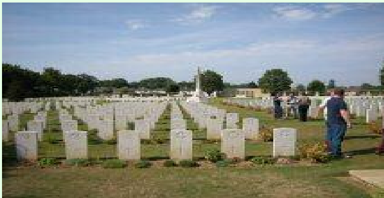
Ranville British Cemetery