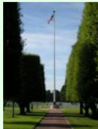
American Cemetery at Colleville Sur Mer

The afternoon was spent viewing Sword beach and Battery Longue. Next day the Group made its way to Arrmanche to see what remains of the incredible Mulberry Harbor built to facilitate supplying the troops, all of which was explained with model displays in the museum. After lunch we arrived at Bayeux, progressed through the gallery housing the long piece of artistic embroidery portraying the events of 1066. Close to our base at Port en Bassin we spent some time later looking at a collection of wrecked tanks etc., recovered from the sea over the last 30 Years.