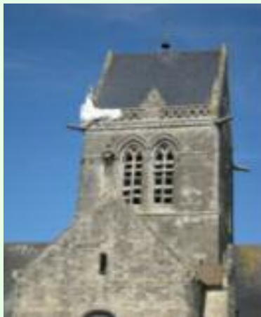
St Mare Eglise He is still up there